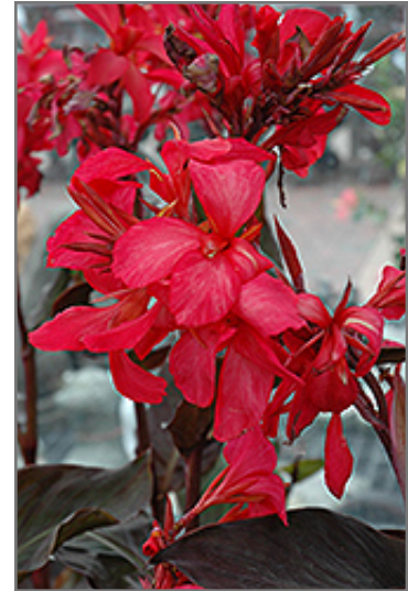
Australia Canna flowers

This plant should only be grown in full sunlight. It requires an evenly moist well-drained soil for optimal growth, but will die in standing water. It is not particular as to soil pH, but grows best in rich soils. It is highly tolerant of urban pollution and will even thrive in inner city environments, and will benefit from being planted in a relatively sheltered location. Consider applying a thick mulch around the root zone in winter to protect it in exposed locations or colder microclimates. This particular variety is an interspecific hybrid. It can be propagated by division; however, as a cultivated variety, be aware that it may be subject to certain restrictions or prohibitions on propagation.