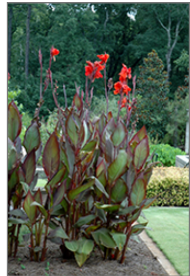
Australia Canna in bloom