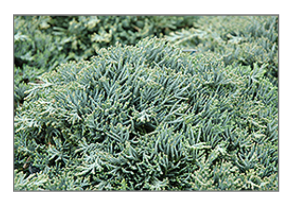
Icee Blue Juniper foliage

This is a relatively low maintenance shrub, and is best pruned in late winter once the threat of extreme cold has passed. Deer don't particularly care for this plant and will usually leave it alone in favor of tastier treats. It has no significant negative characteristics.