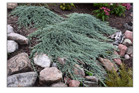
Icee Blue Juniper

Icee Blue Juniper is a multi-stemmed evergreen shrub with a ground-hugging habit of growth. It lends an extremely fine and delicate texture to the landscape composition which should be used to full effect.