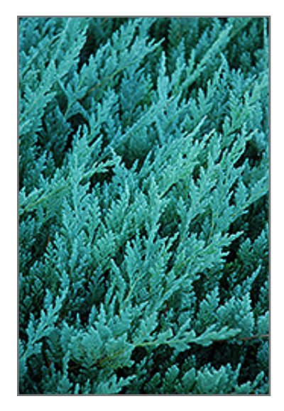
Blue Chip Juniper foliage