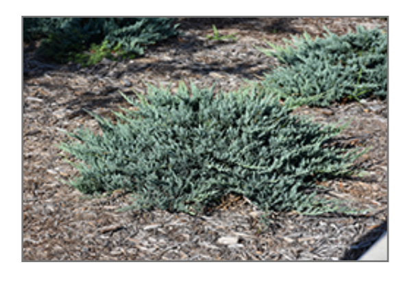
Blue Chip Juniper