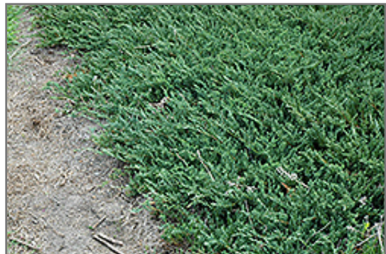
Bar Harbor Juniper