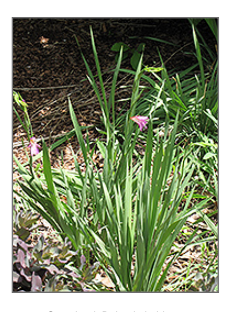
Snowbank Boltonia in bloom

Snowbank Boltonia is smothered in stunning clusters of lightly-scented white daisy flowers with yellow eyes at the ends of the stems from late summer to mid fall. The flowers are excellent for cutting. Its pointy leaves emerge light green in spring, turning grayish green in colour. The foliage often turns yellow in fall.