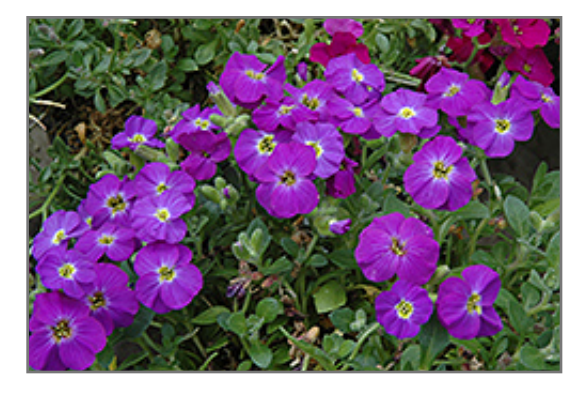
Axcent Violet With Eye Rock Cress flowers