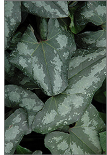
Quicksilver Asian Wild Ginger foliage

Quicksilver Asian Wild Ginger will grow to be only 6 inches tall at maturity, with a spread of 12 inches. Its foliage tends to remain low and dense right to the ground. It grows at a fast rate, and under ideal conditions can be expected to live for approximately 10 years. As an herbaceous perennial, this plant will usually die back to the crown each winter, and will regrow from the base each spring. Be careful not to disturb the crown in late winter when it may not be readily seen!