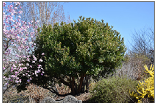
Strawberry Tree