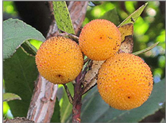
Strawberry Tree fruit

Strawberry Tree is recommended for the following landscape applications;