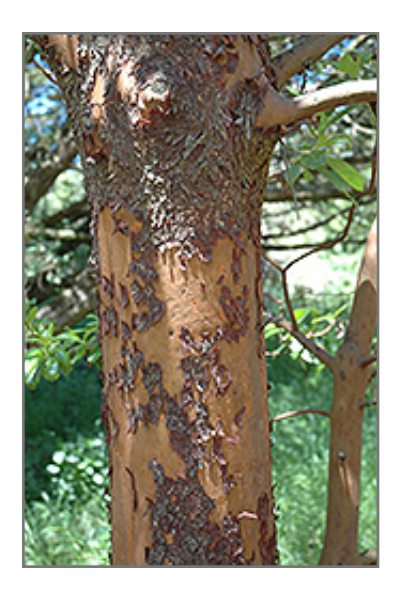
Pacific Madrone bark