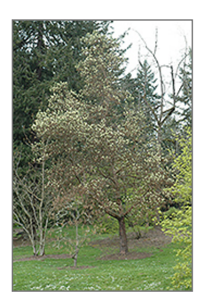
Pacific Madrone in bloom