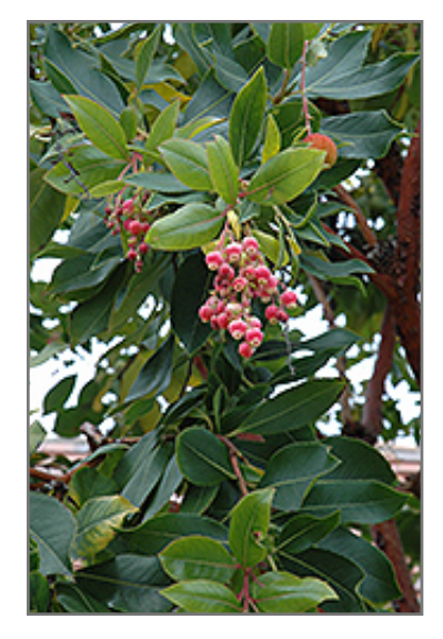
Pacific Madrone flowers

This tree should only be grown in full sunlight. It is very adaptable to both dry and moist growing conditions, but will not tolerate any standing water. It is considered to be drought-tolerant, and thus makes an ideal choice for xeriscaping or the moisture-conserving landscape. It is not particular as to soil type or pH. It is somewhat tolerant of urban pollution. This species is native to parts of North America.