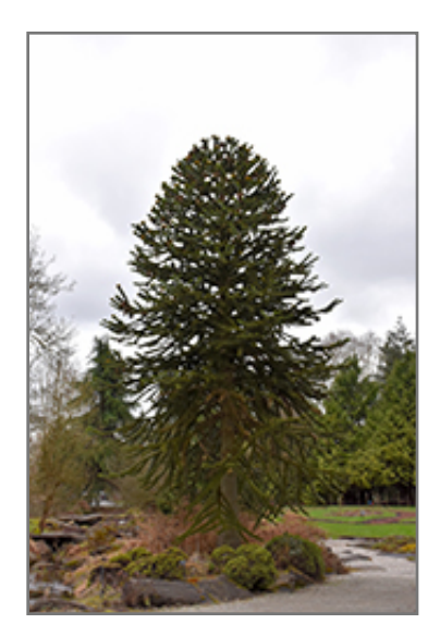
Monkey Puzzle Tree