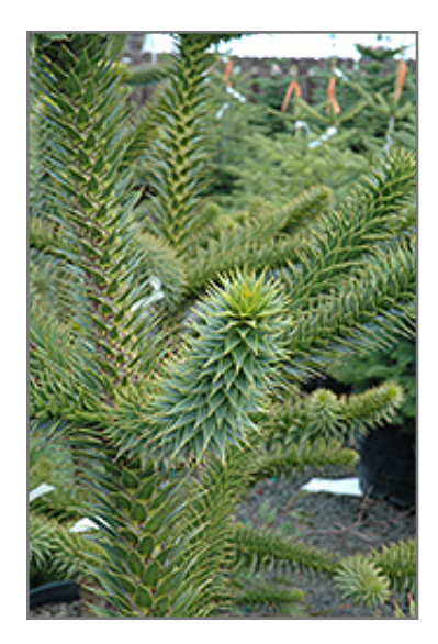
Monkey Puzzle Tree foliage