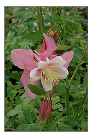
Music Red WhiteColumbine flowers