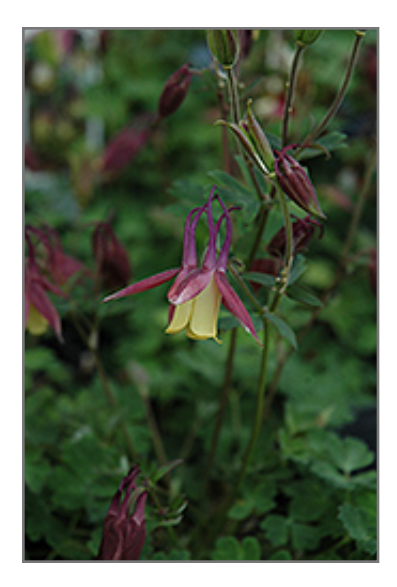
Blackcurrant Ice Columbine flowers

Attractive deep purple-blue flowers with butter yellow edged cups and interesting spurred petals rise over the medium blue-green delicate foliage; a wonderful addition to border edges or massed in the garden; will tend to self seed