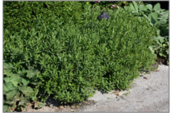
Blue Ice Star Flower

This plant does best in full sun to partial shade. It prefers to grow in average to moist conditions, and shouldn't be allowed to dry out. It is not particular as to soil type or pH. It is quite intolerant of urban pollution, therefore inner city or urban streetside plantings are best avoided. This is a selection of a native North American species. It can be propagated by cuttings; however, as a cultivated variety, be aware that it may be subject to certain restrictions or prohibitions on propagation.