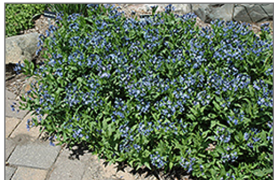
Blue Ice Star Flower in bloom