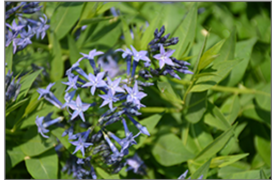
Blue Ice Star Flower flowers