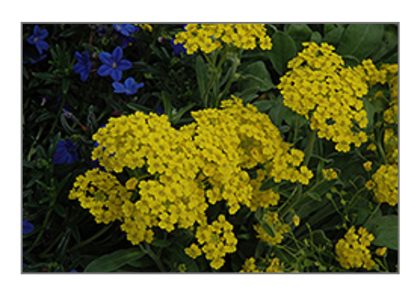
Summit Alyssum flowers

Sown in early spring, this variety quickly matures into a glorious mat of bright yellow in a dazzling floral display all season long; trim back to get returning blooms; an arresting sight when massed