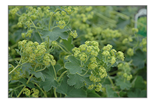
Gold Strike Lady's Mantle flowers