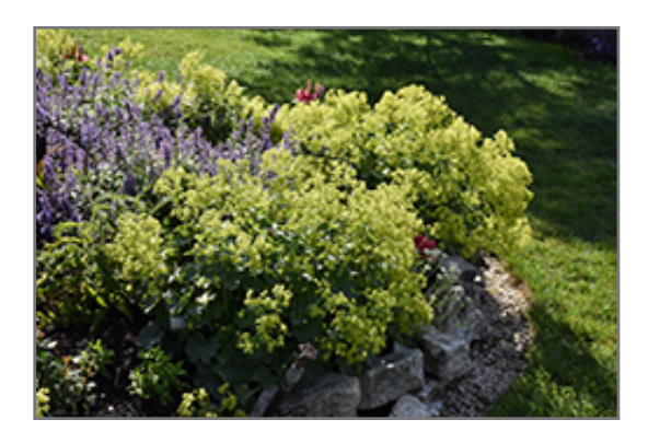
Gold Strike Lady's Mantle in bloom

Gold Strike Lady's Mantle is recommended for the following landscape applications;