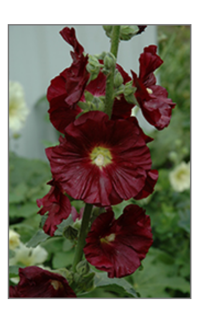
Summer Memories Hollyhock flowers

Summer Memories Hollyhock features bold spikes of gold round flowers with buttery yellow centers rising above the foliage from mid to late summer. The flowers are excellent for cutting. Its large lobed leaves remain green in colour throughout the season.