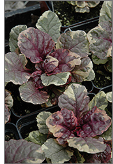
Pretty Colors Bugleweed foliage