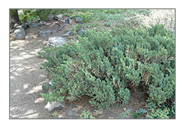
San Jose Juniper

San Jose Juniper will grow to be about 12 inches tall at maturity, with a spread of 5 feet. It tends to fill out right to the ground and therefore doesn't necessarily require facer plants in front. It grows at a slow rate, and under ideal conditions can be expected to live for approximately 30 years.