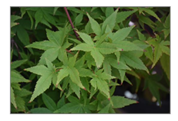
Ryusen Japanese Maple foliage