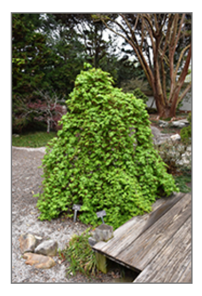
Ryusen Japanese Maple