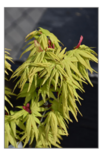
Mikawa Yatsubusa Japanese Maple foliage

Mikawa Yatsubusa Japanese Maple is recommended for the following landscape applications;