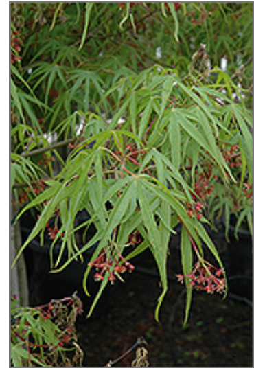
Ao Shime No Uchi Japanese Maple flowers