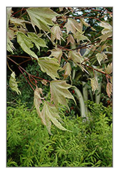
Usugumo Japanese Maple foliage

Usugumo Japanese Maple has attractive green deciduous foliage on a tree with a round habit of growth. The lobed palmate leaves are highly ornamental and turn outstanding shades of yellow, orange and rose in the fall.