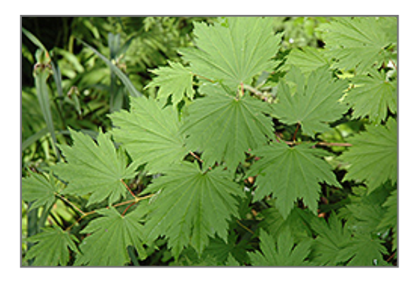
Emmett's Pumpkin Fullmoon Maple foliage

A stunning and shapely tree that is the ideal size for the home landscape, interesting in all seasons; red foliage in spring that mixes with green into the summer, and a glorious orange display in fall