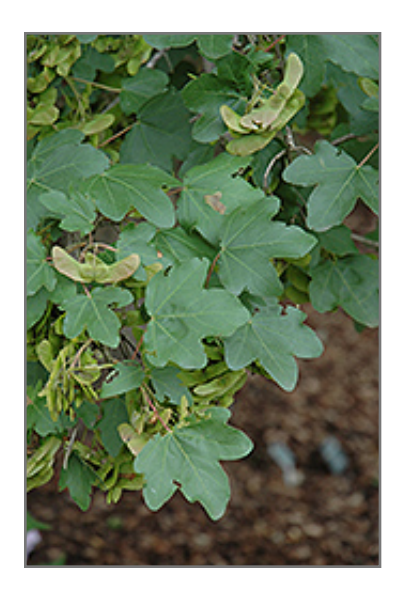
Evelyn Hedge Maple foliage