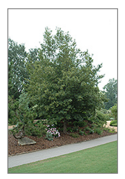
Evelyn Hedge Maple