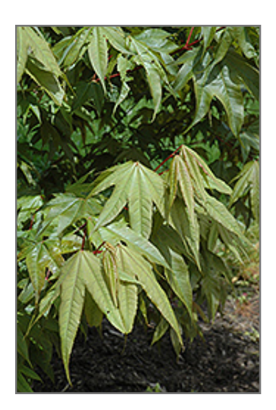
Campbell's Maple foliage