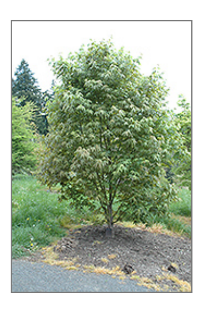
Campbell's Maple