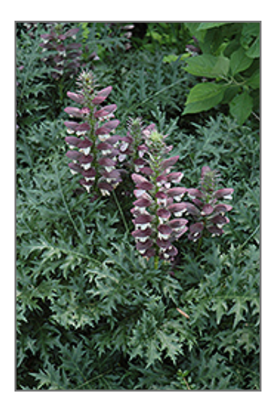
Summer Beauty Bear's Breeches in bloom