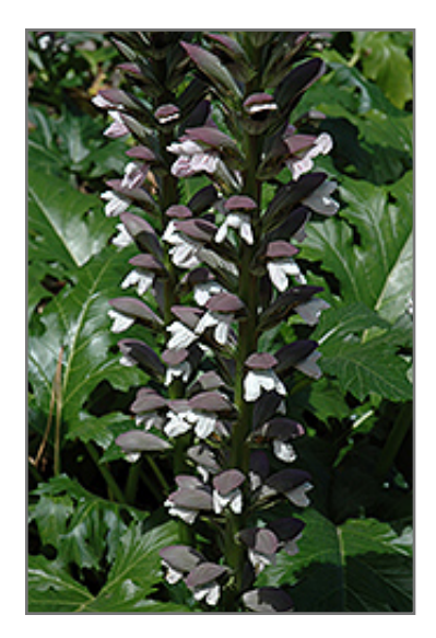
Summer Beauty Bear's Breeches flowers