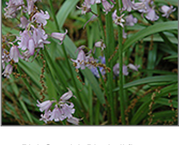
Pink Spanish Bluebell flowers

This little spring-blooming cutie is a fantastic choice for its grassy foliage and dainty soft pink bells that rise above the leaves on stalks, every bit as pretty as it sounds; will slowly naturalize in the garden, tends to go dormant over the summer