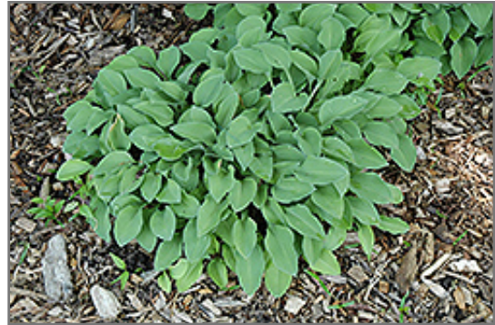
Mesa Verde Hosta