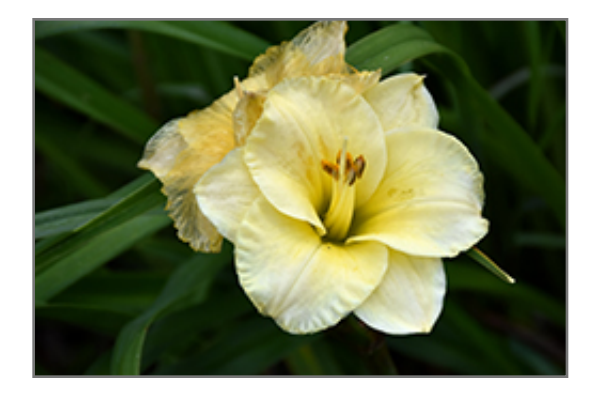
When Fortune Smiles Daylily flowers