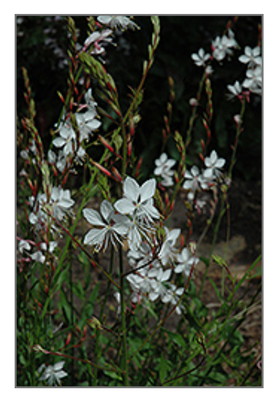
Prachtkerze Gaura flowers

Naturally compact and free flowering, this selection features tall swaying stems of white flowers with pink overtones, rising above low mounds of green foliage; excellent in garden beds and containers; beautiful addition to cut-flower arrangements