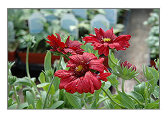
Sunset Burgundy Blanket Flower flowers

Other Names: Blanketflower, Indian Blanket