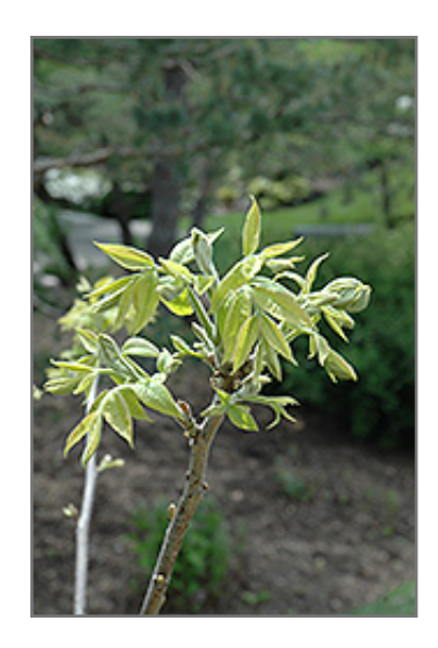
Montgomery Pecan foliage