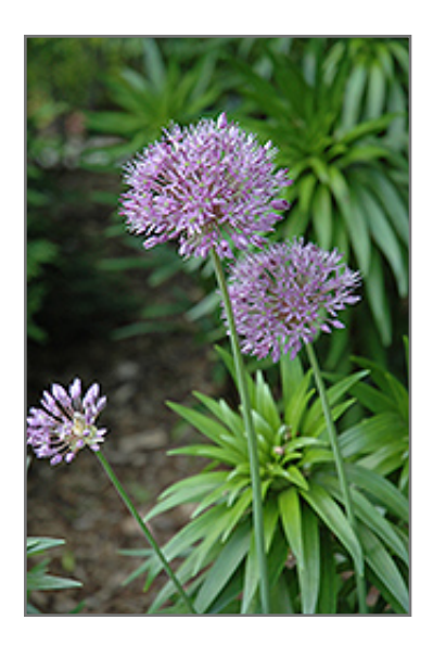
Royal Fantasy Ornamental Onion flowers

Lightly scented spheres of purple flowers rise above low mounded, fragrant foliage on tall sturdy stalks during late spring and early summer; a lovely addition to cut flower arrangements or garden beds; sword-like foliage remains throughout summer