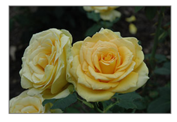
Limelight Rose flowers

Limelight Rose is recommended for the following landscape applications;