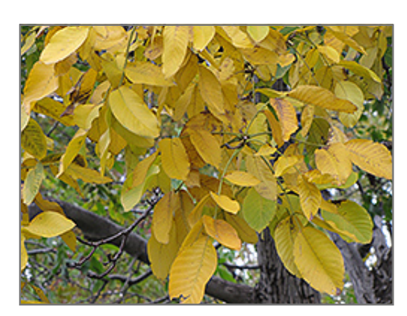
Carpathian English Walnut foliage

Carpathian English Walnut has dark green deciduous foliage on a tree with a round habit of growth. The large pinnately compound leaves turn yellow in fall. It produces brown nuts in late fall. The fruit can be messy if allowed to drop on the lawn or walkways, and may require occasional clean-up.