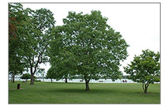
Carpathian English Walnut

A large shade tree selected for its commercial-grade fruit; compound leaves provide an interesting texture, best for larger landscapes and nut orchards, attracts squirrels, can be somewhat messy