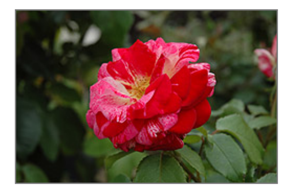
Tango Rose flowers