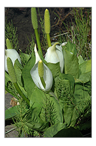
Asian Skunk Cabbage flowers

Asian Skunk Cabbage is recommended for the following landscape applications;