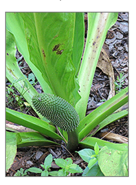
Asian Skunk Cabbage in bloom