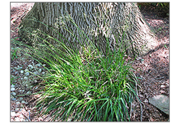
Greater Wood Rush