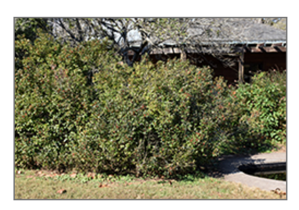
Afterglow Winterberry fruit

Afterglow Winterberry is a dense multi-stemmed deciduous shrub with a shapely oval form. Its average texture blends into the landscape, but can be balanced by one or two finer or coarser trees or shrubs for an effective composition.