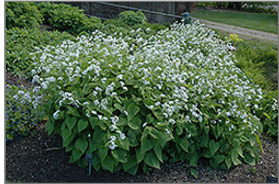
Perennial Money Plant in bloom