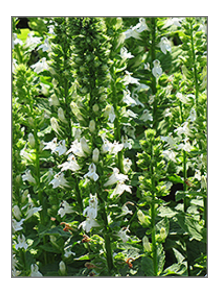
White Cardinal Flower flowers