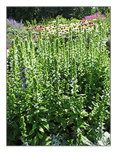
White Cardinal Flower in bloom