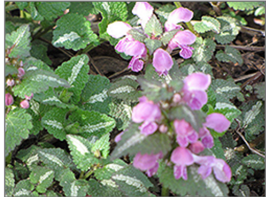
Roseum Spotted Dead Nettle flowers

Other Names: Deadnettle, Creeping Lamium