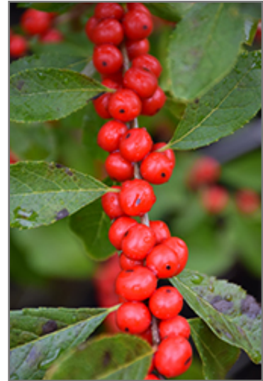
Red Sprite Winterberry fruit