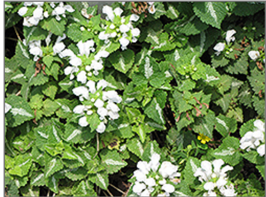
White Spotted Dead Nettle flowers