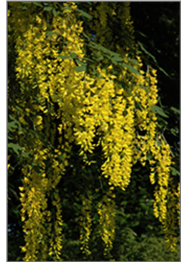
Weeping Laburnum flowers