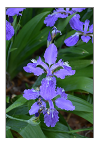
Rooftop Iris flowers