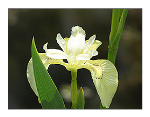
Milton Iris flowers