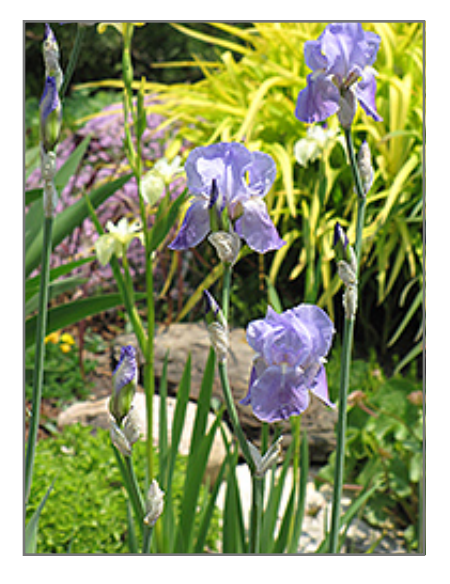
Then Again Iris flowers

This is a must have iris with its incredible airy sky blue blooms and stunning, unique white beard is a captivating addition to the perennial border; also excellent massed in groupings in the garden; will quickly form dense colonies