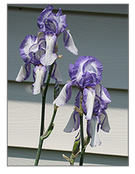
Deuce Iris flowers

This tall, interesting iris with its complimentary blue and white blooms is a captivating addition to the perennial border; also excellent massed in groupings in the garden; will quickly form dense colonies