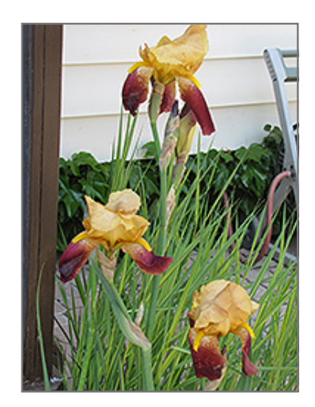
Cheshire Cat Iris flowers