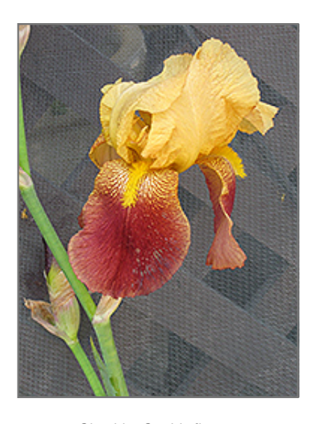
Cheshire Cat Iris flowers